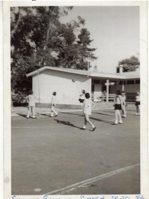
Swans V. Beavers Swans d. 28-30 64